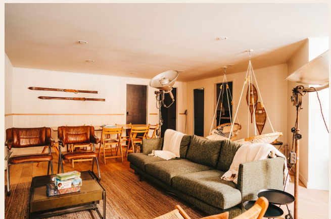
LOUNGE & MEETING SPACE